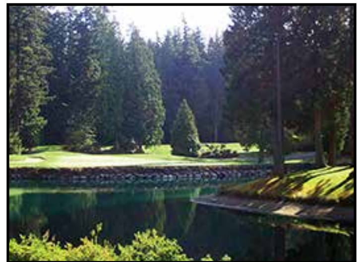
Sahalee in Sammamish, Wash. could host a PGA Tour event during the 2028 season.

Stay tuned on this story. But just the fact the Pacific Northwest is in the conversation for the 2028 PGA Tour season is exciting news for golf fans around the Pacific Northwest. No dates or anything has been talked about but the tour would not want it conflict with the Boeing Classic.