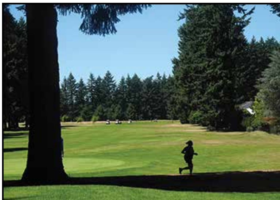
Glendoveer is known for many things including its two golf courses and its jogging trail which surrounds the area.