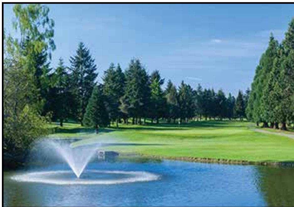
Cedar Irons in Tacoma (formerly North Shore) is an impressive re-model owner by the Puyallup Tribe of Indians.