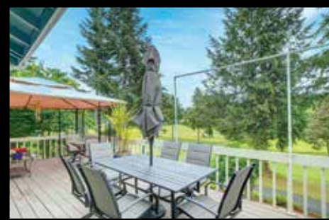
Two Golf Courses: Executive Nine and The 18-hole Championship Ranch Course