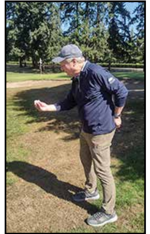
You have options if you find a questionable situation.