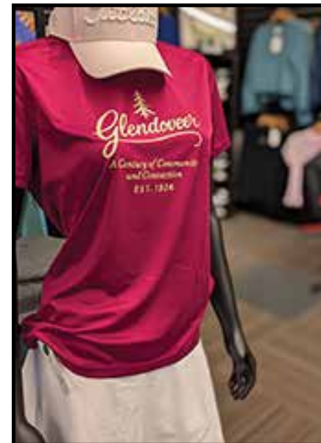
Golfers get ready to play on opening day 100 years ago (left); merchandise reflects the 100-year celebration.