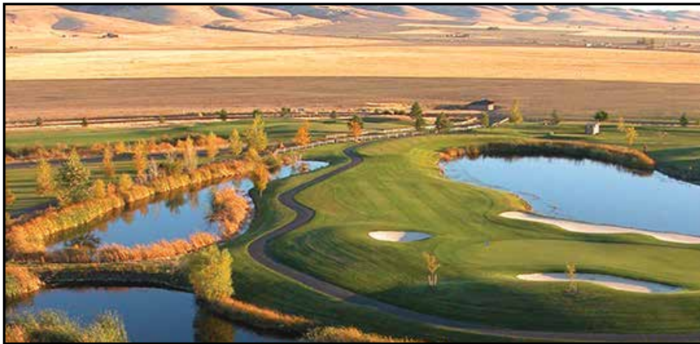
The Standard Portland Classic (top) photo and the Wildhorse Ladies Classic at Wildhorse Resort (bottom) have joined forces to promote women's golf in the NW.