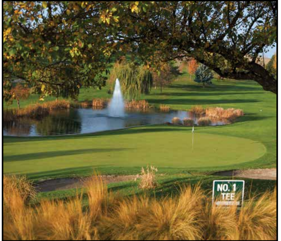
Horn Rapids in Richland is a desert experience (top); Canyon Lakes Golf Course (bottom) features plenty of challenges and the new owners moved Golf Universe store to the location.