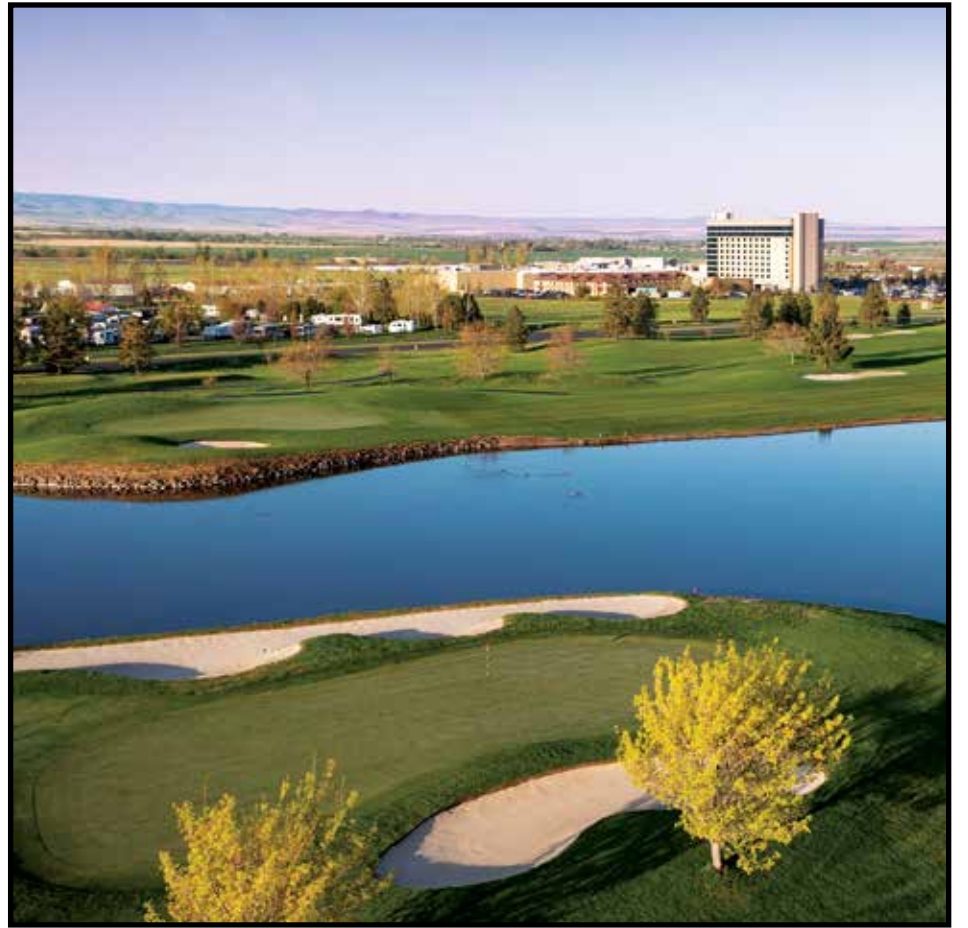
Wildhorse Resort in Pendleton is a quick trip into Oregon when visiting Central Washington

Wildhorse Resort & Casino is simply a des-