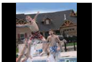
2 Heated Swimming Pools