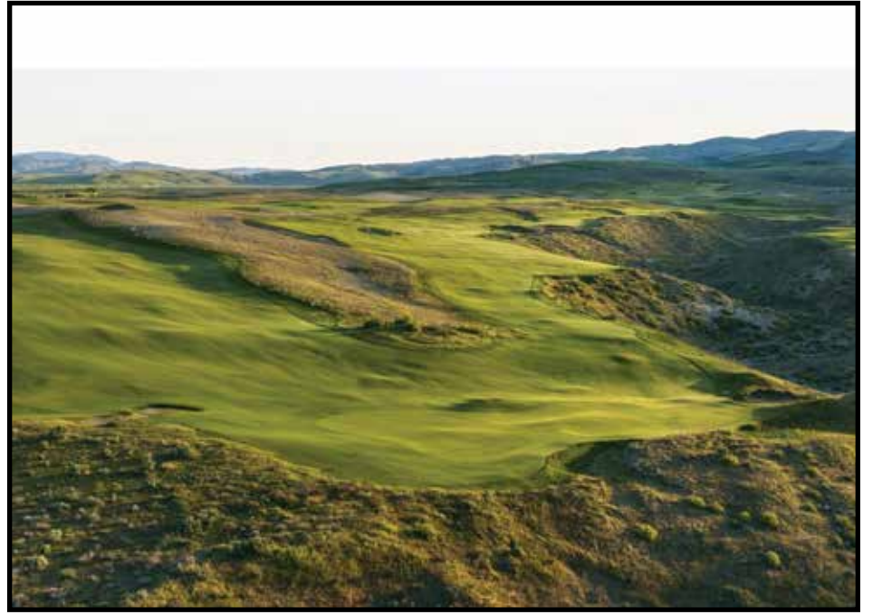
Gamble Sands in Brewster has opened a second course called Scarecrow to tee it up.

Located in Richland, Columbia Point Golf