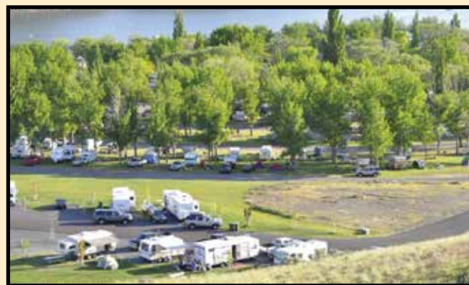
Sun Lakes Resort is a complete family resort experience.