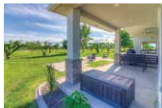
Outdoor living at its finest

Located in Toppenish, Mount Adams Country Club traces its roots back to 1926 and celebrated its centennial this year. The course was recently sold and closed down to make significant changes. The course is expected to reopen later this year.