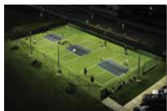
Lighted Pickleball Courts