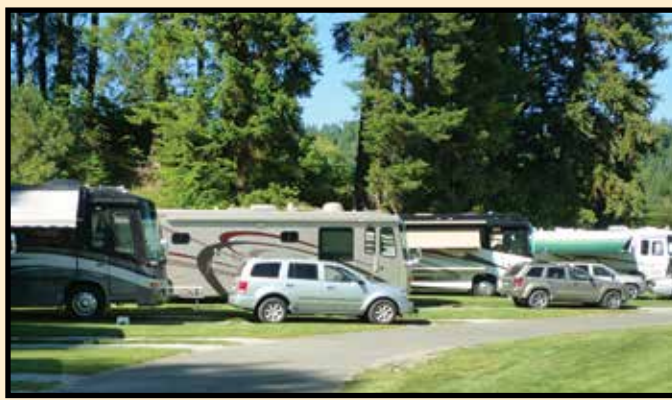
Sun Country offers a challenging 18-hole course plus RV parking.