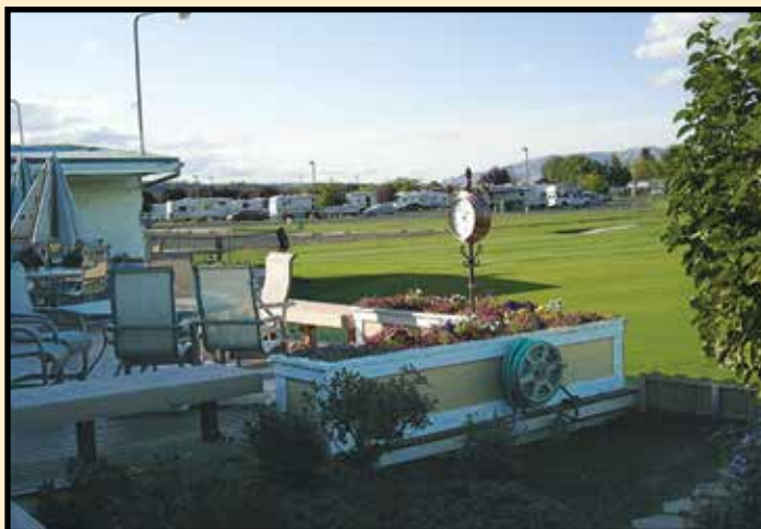
Suntutides in Yakima has 60 full hook-up RV spaces.

• Colockum Ridge Golf Course: The course has been up-graded and is a popular place for local and RV travelers that want an easy course to walk. There are 18 sites available and reservations are recommended.