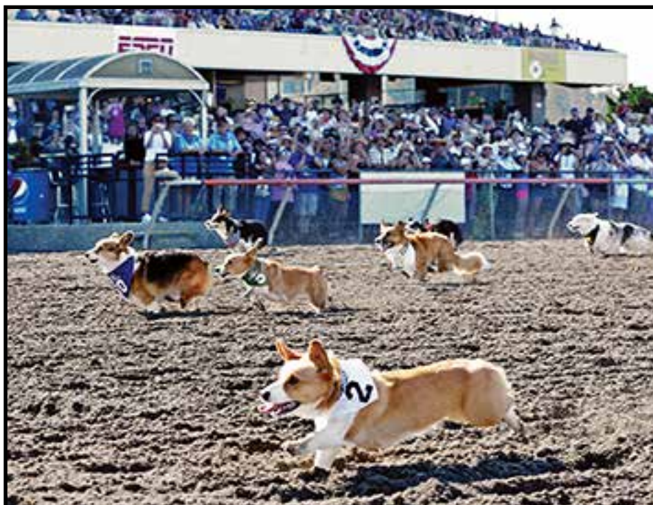
Mount Rainier makes a scenic backdrop at Emerald Downs (top); the Indian Relays are set for a three-day run in June (lower left), the Corgis will race June 27-28 (bottom right).