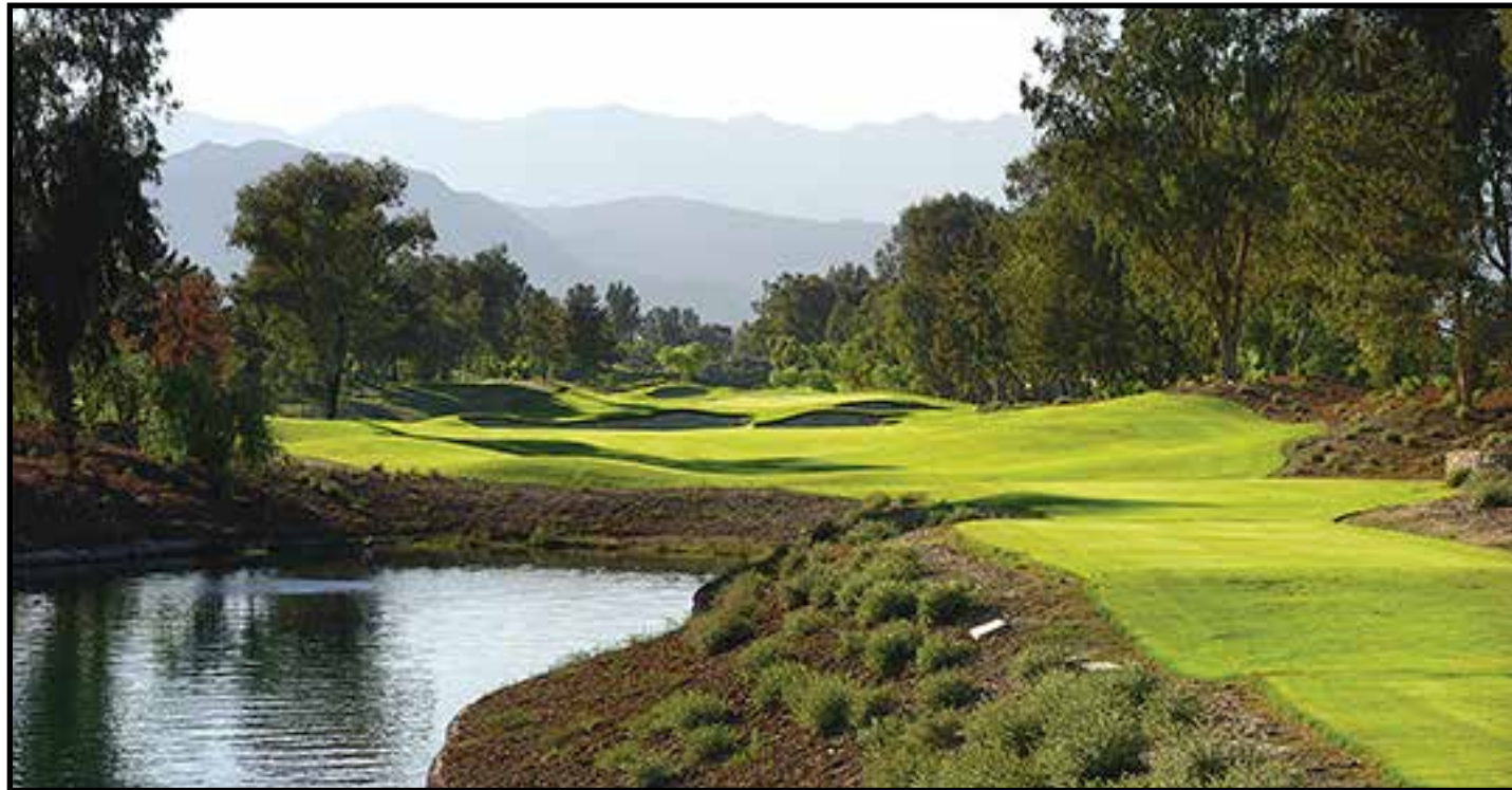
Indian Wells' Players Course has been newly renovated and is a challenge from start to finish (top); Desert Willow offers two courses, including the Resort course (below).

In addition, the extensive renovation work, players will have the option of playing the course from the original "Skins Tees," experiencing the course the way Tiger Woods, Fred Couples, and Phil Mickelson did back in its heyday. In fact the holes all have names on them as you make your way around the 18 holes. The ninth hole is called Funk's Millions, named for Fred Fun winning a big skin on that particular hole, the par-3 17th is called Tiger's Waterloo after he knocked it into the water. And the 18th hole is Annika's Miracle, named