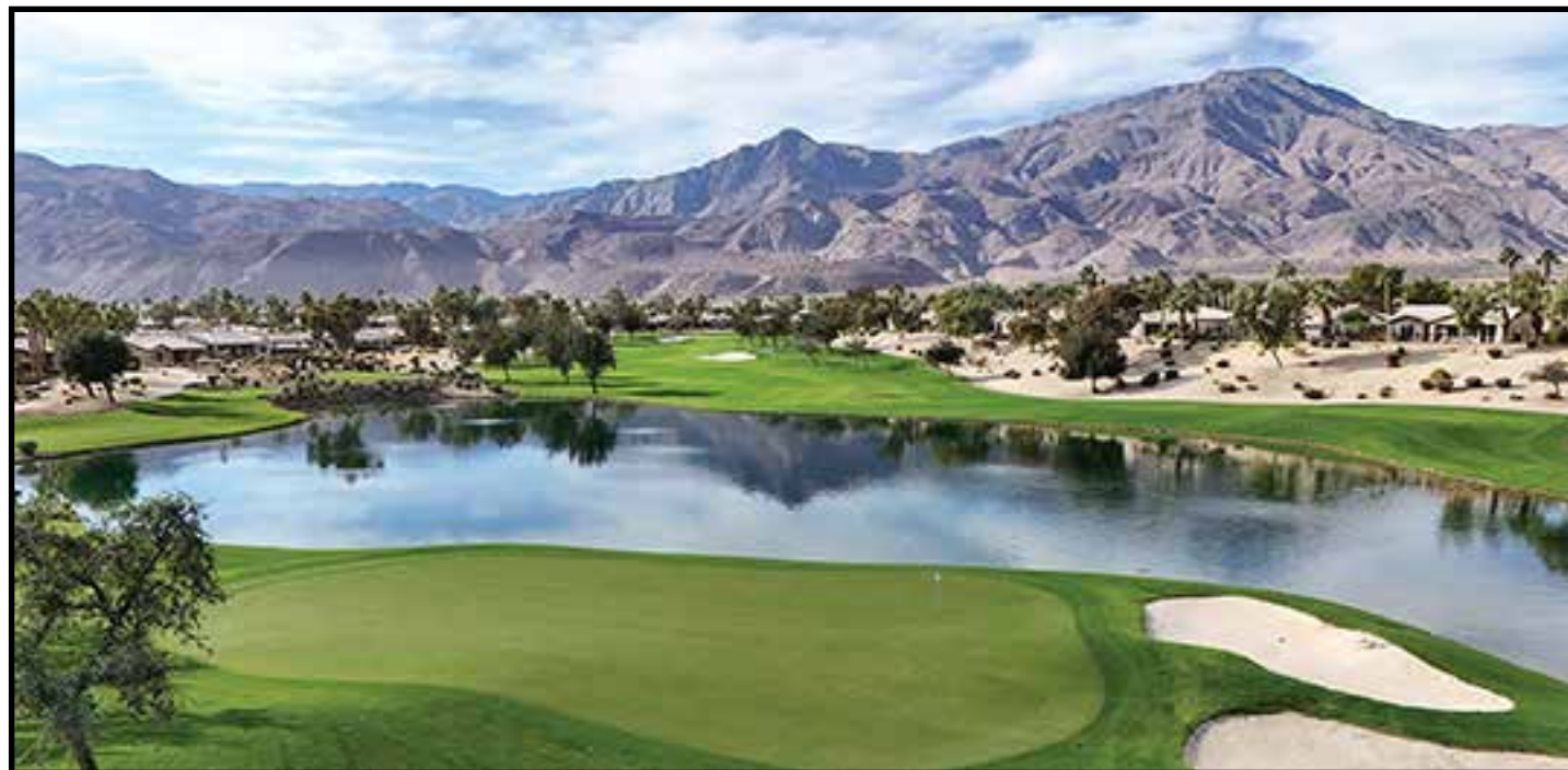
Tahquitz Resort is a place with two championship courses (top photo) Trilogy Golf Course (bottom photo) was the original host course for The Skins Game.