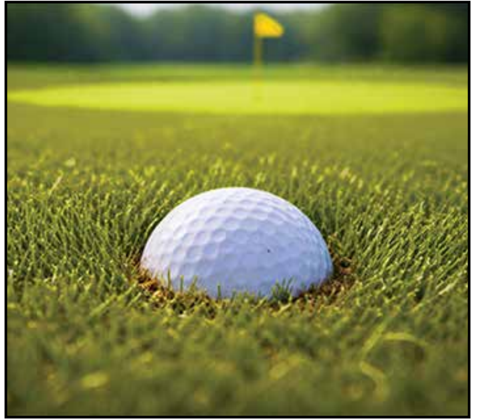
If your ball becomes embedded during your round it's important to know how to take the proper relief.

If your ball embeds in the general area you take relief by finding the reference point (which is the spot directly behind where the ball is embedded), measure one club length from the reference point to create your relief area, which cannot be nearer the hole than your reference point, and must be in the