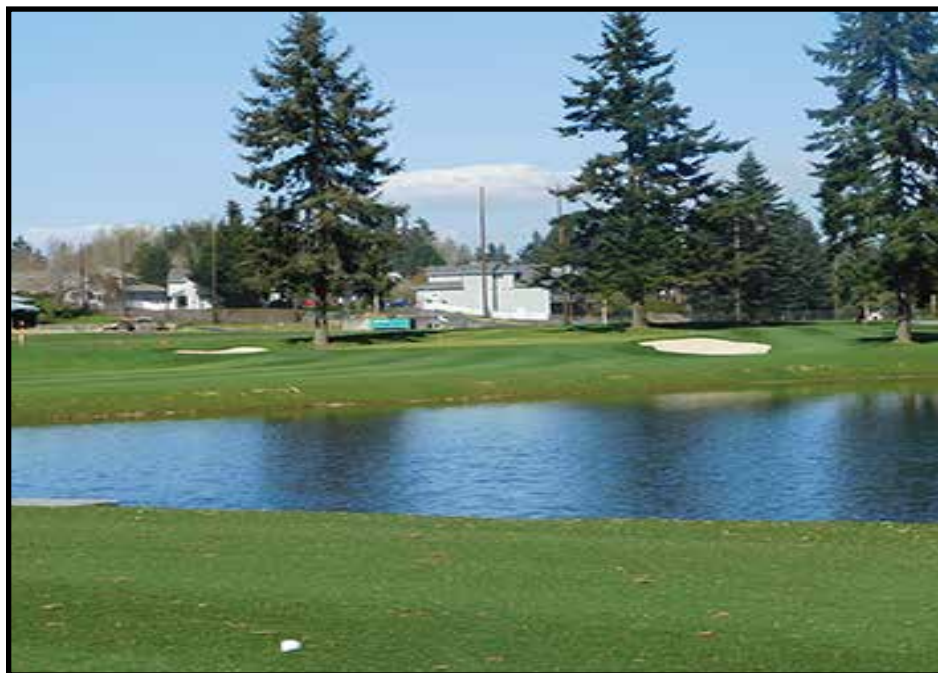
North Shore Golf Course in Tacoma is re-opening all 18 holes this spring a new reimagined look and feel.