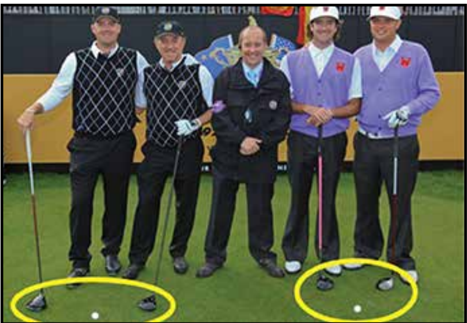
Make sure you always tee off in the correct order when you are playing in foursomes - also called alternate shot.

Paul and Chase are partners in a Foursomes competition. Only one player tees off