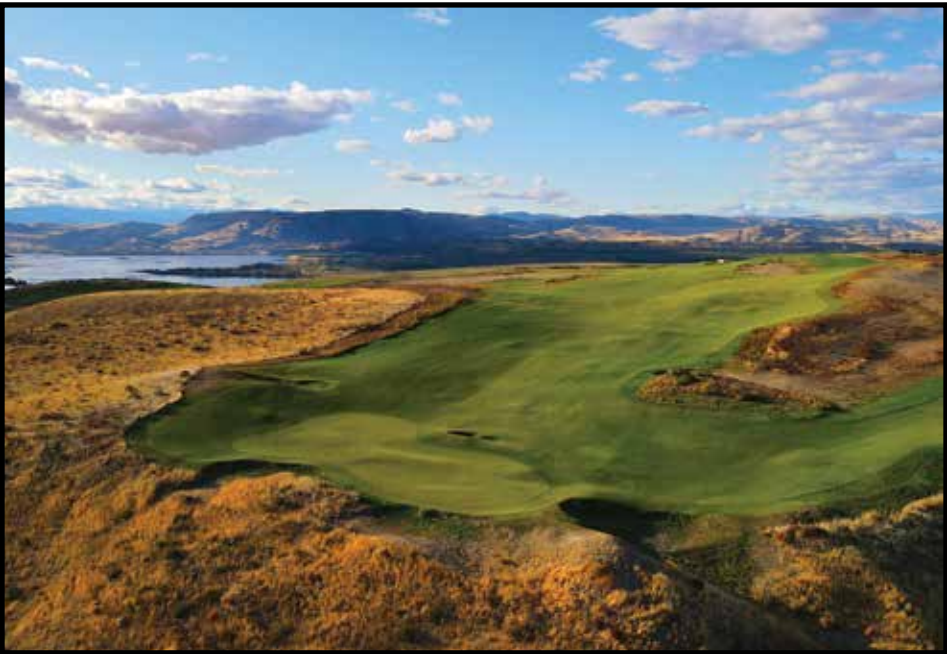
Gamble Sands' Scarecrow has won several awards since its opening in 2025 as Best New Public Golf Course.

Two courses on one property, both inside the Top 75. That says a lot about what the owners of Gamble Sands are trying to do in building one of Washington’s leading golf resorts — it’s a destination that attracts golf connoisseurs from near and far and gives them a reason to stay multiple days for an unforgettable golf experience when they visit Central Washington.