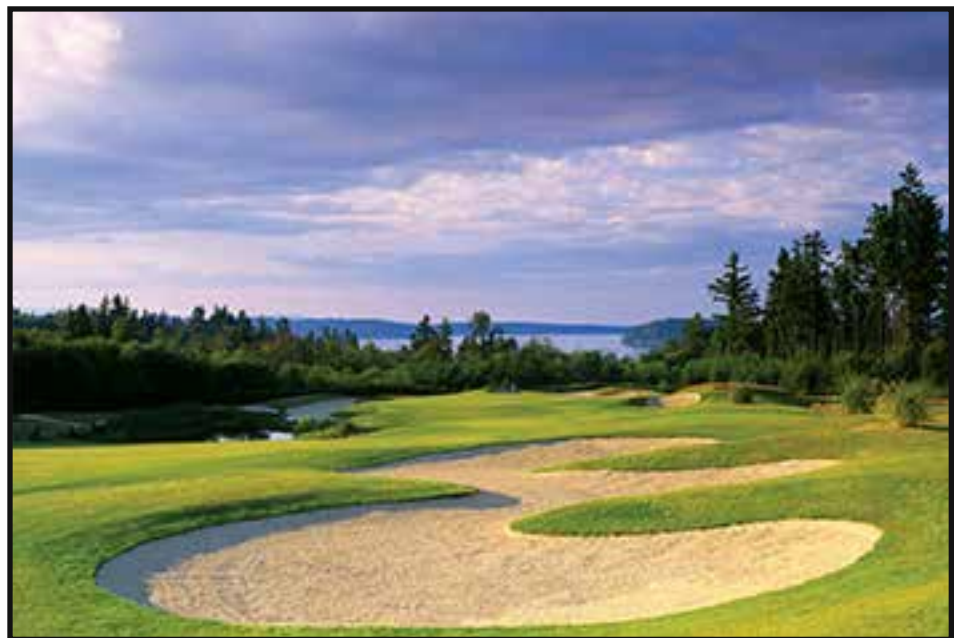
Hawk's Prairie in Lacey, Wash. has two courses to try - the Woodlands Course and Links Course.