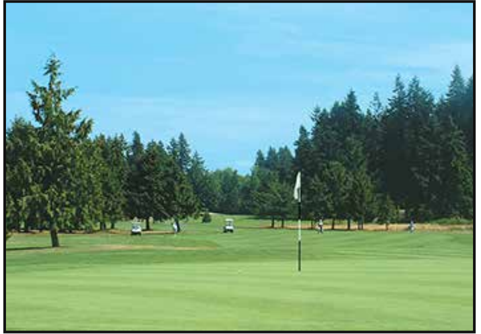
If you are a looking for a place to tee it up right off I-5, Tumwater Golf Course is a solid choice.

Through the Washington Youth Golf Academy at Camas Meadows, the course reaches over 14,000 youths across three school districts at no cost to the schools. In addition, the course has been recognized by the PNW PGA for its adult development programs.