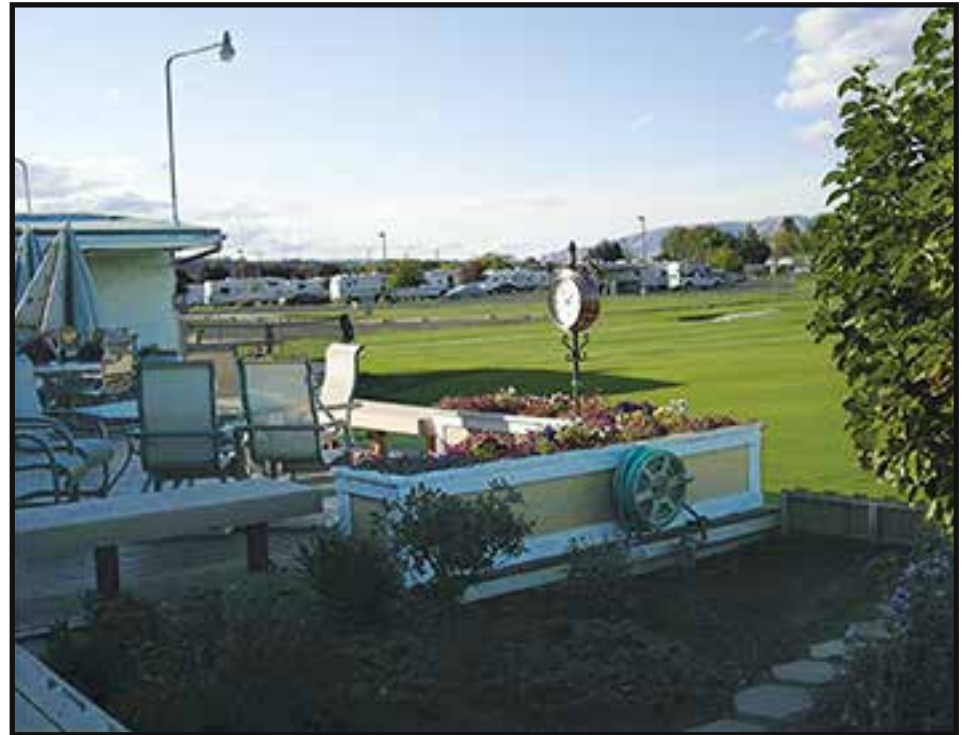
Suntides GC in Yakima has an upscale RV park with 60 sites and a bike/walking trail.

Check course websites to see their specials and the availability for the times you want to travel. Happy camping!