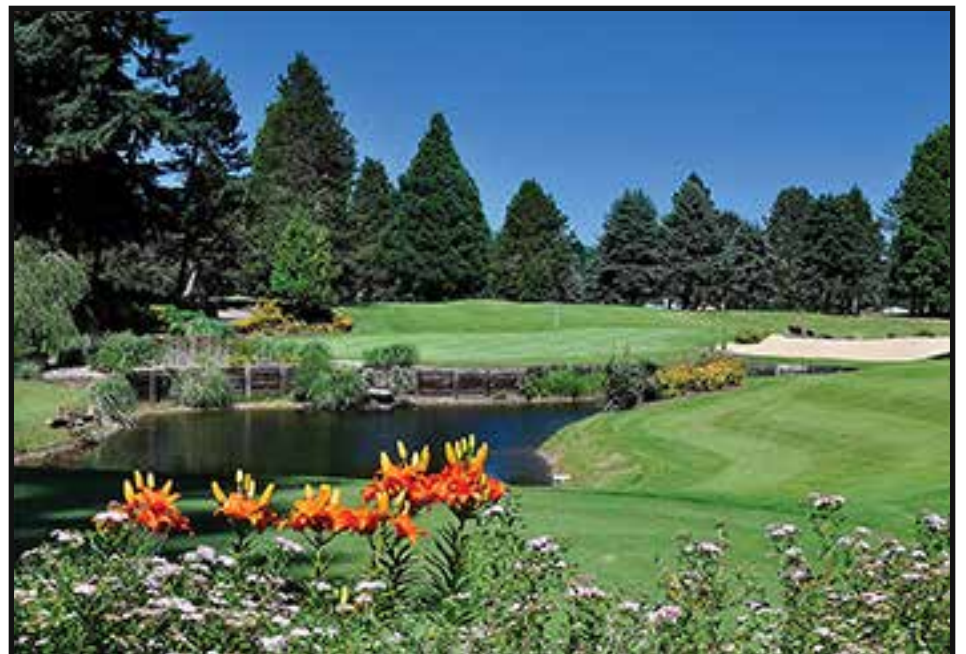
Lewis River Golf Course in Woodland has new ownership and plans some big improvements.