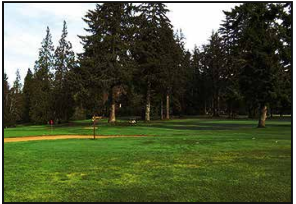
Historical Grays Harbor Country Club is a challenging 9-hole semi-private course located in Aberdeen.