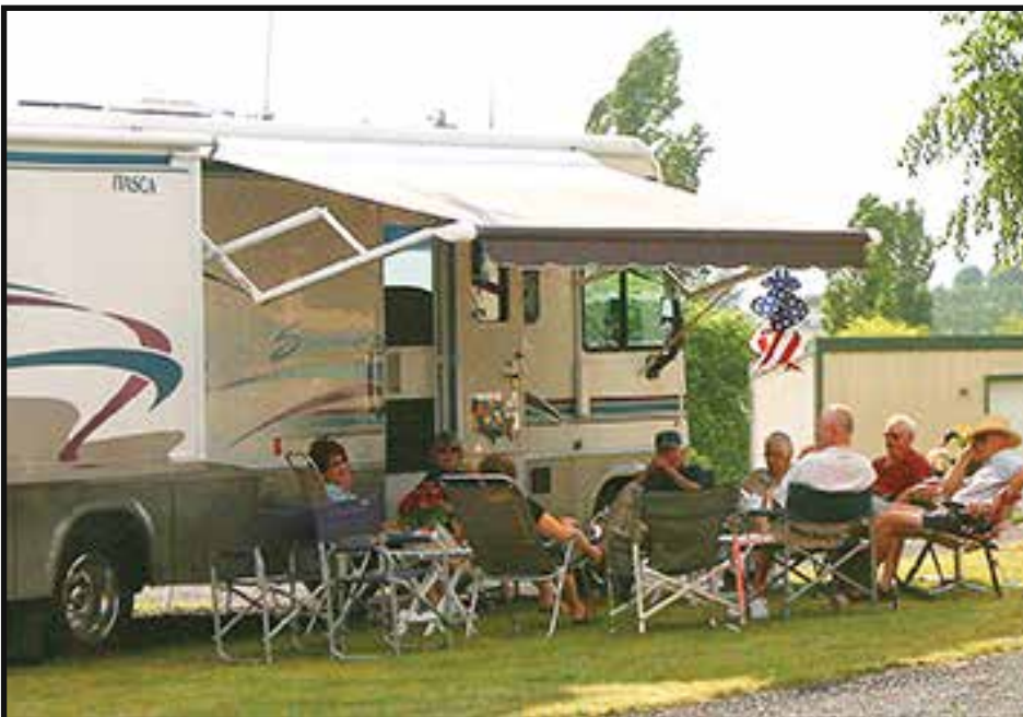
Sage Hills Golf and RV Resort can handle big rigs and has 50 level sites to choose from.