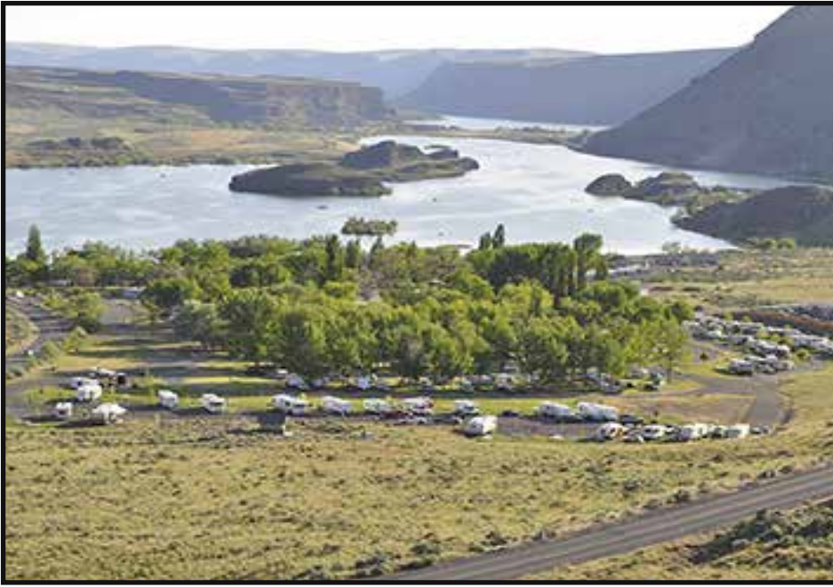
Sun Lakes in Coulee City, Wash. offers 152 RV spots and the Vic Meyers Golf Course.