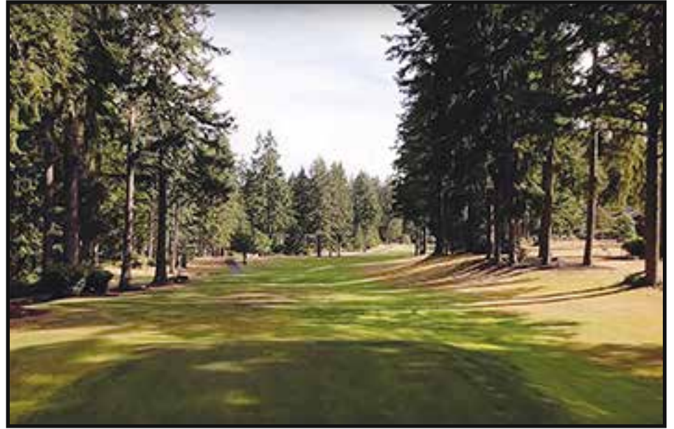
Shelton's Lake Limerick GC rated #19 in the Top Public Short Courses in the U.S. by Golf Pass

Mint Valley Golf course in Longview is an 18 hole course and one of the real good public tracks just a short drive off Interstate-5. They have a covered range and a 6-hole par 3 pitch and putt course for anyone from beginners to families to try. The