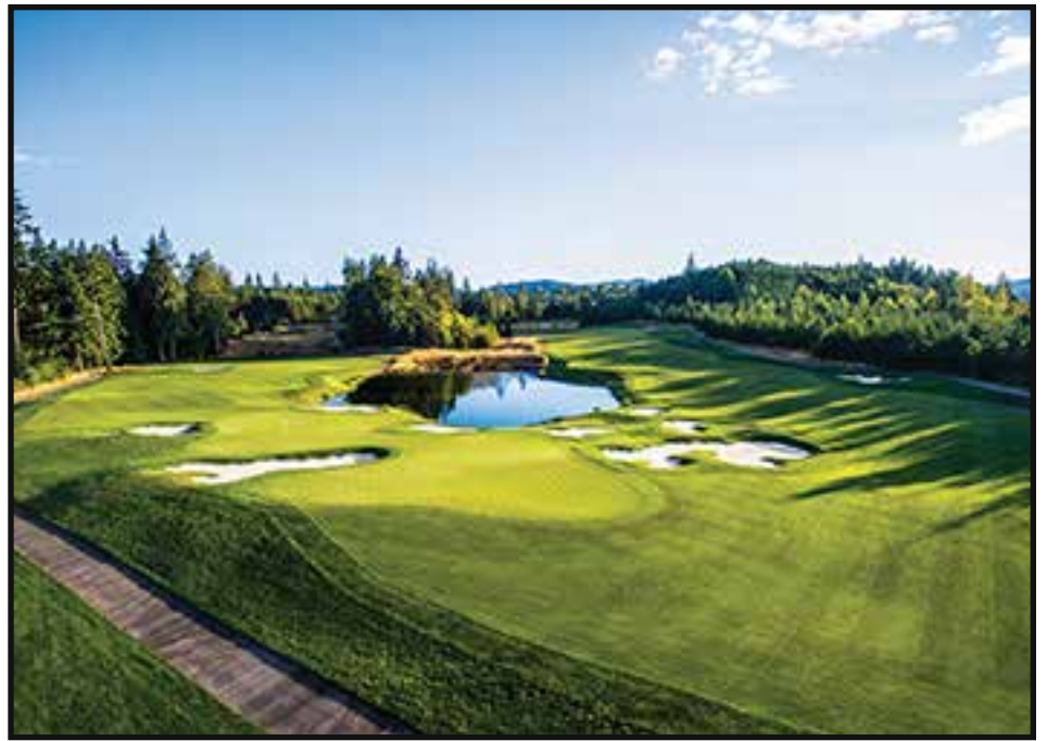
Salish Cliffs Golf Club is part of the Little Creek Resort in Shelton and offers spots for RV's.

One of the favorite layouts among the Oki Golf properties for its challenging design and year round playability. The club opened as private but recently has gone to taking public tee times