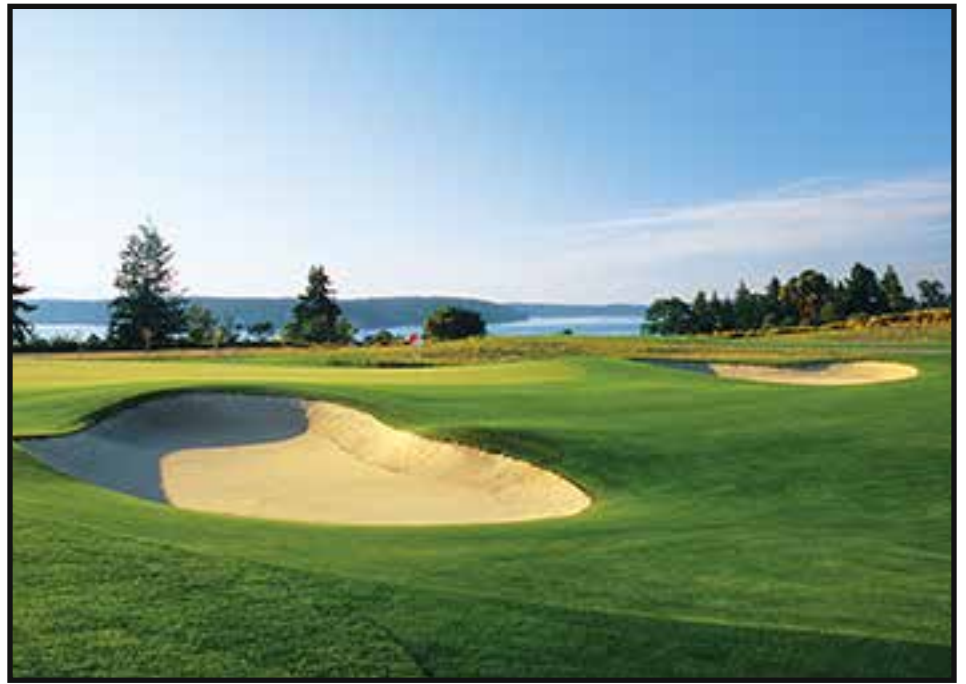
The Home Course is an awards winning course and hosted several state and regional events.

Lewis River Golf Course has endured a lot in its 50+ years of existence. And now it is under new ownership.