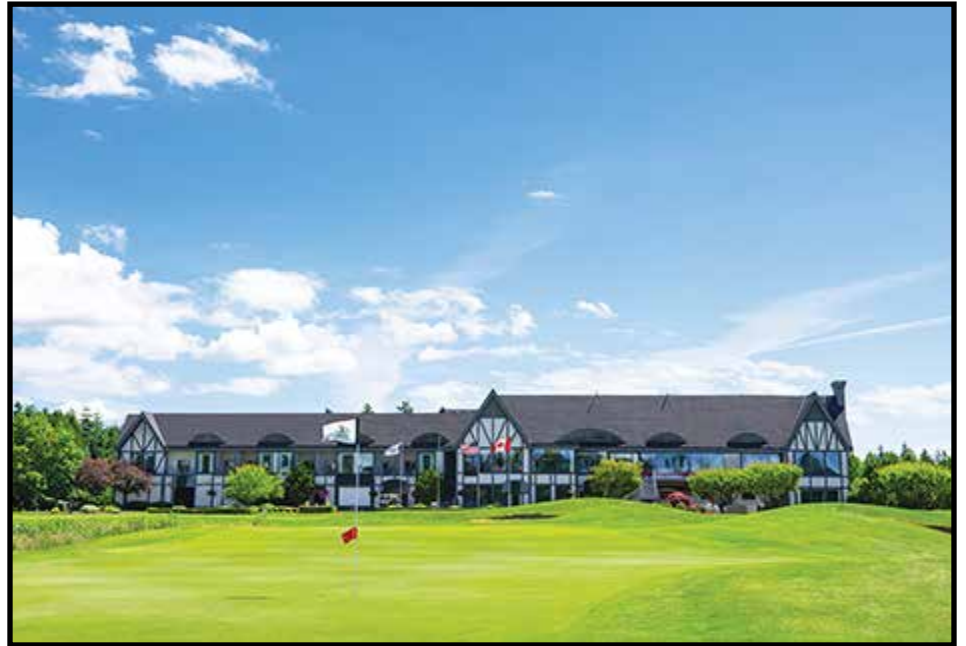
Loomis Trail is now owned by the Lummi Nation Indian Tribe, which also owns the Silver Reef Casino.

For more information on what Loomis Trail has to offer see www.golffloomis.com .