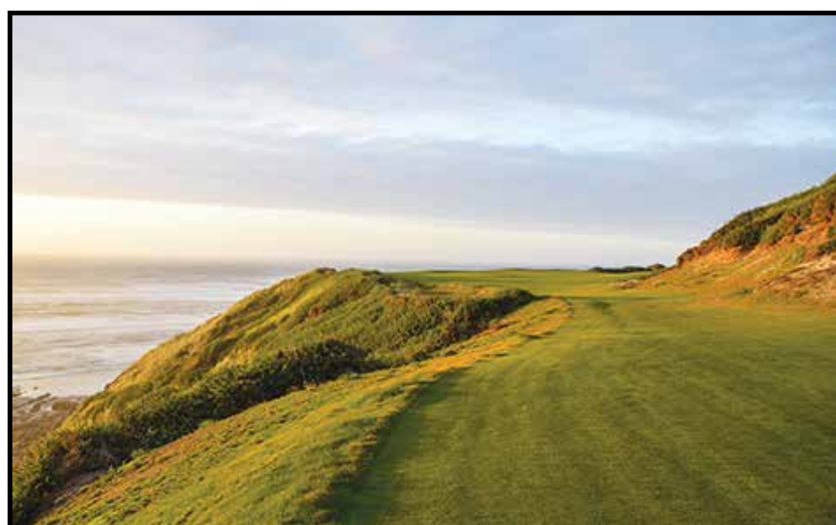
Bandon Dunes Resort on the Oregon Coast is expected to open up its Sheep Ranch Course in June of 2020.