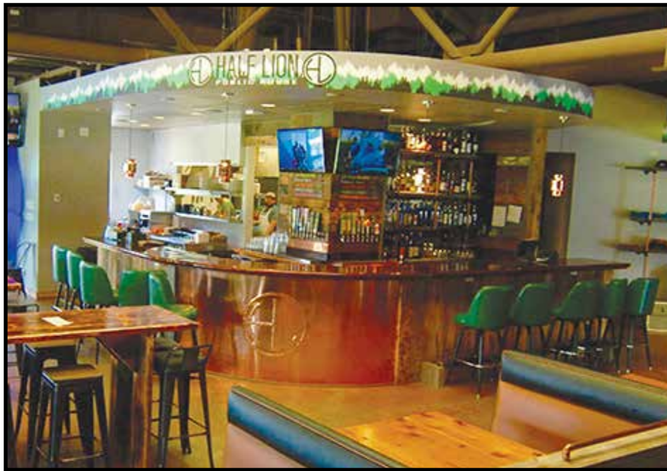
Half Lion owns the restaurant at Riverbend Golf Course (above) plus another establishment in Sumner.