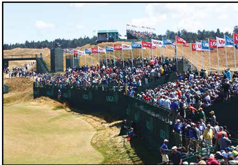
The 2015 U.S. Open at Chambers Bay may be the closest thing the Puget Sound area gets to a PGA Tour event.