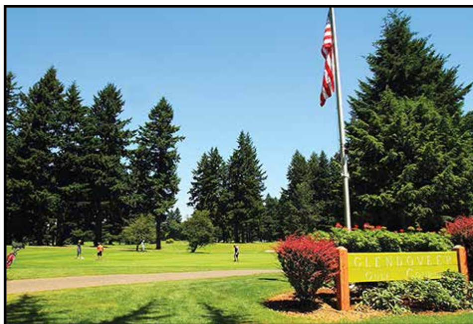
You can take your pick of courses at Glendoveer Golf Course in Portland from the two 18-hole courses.