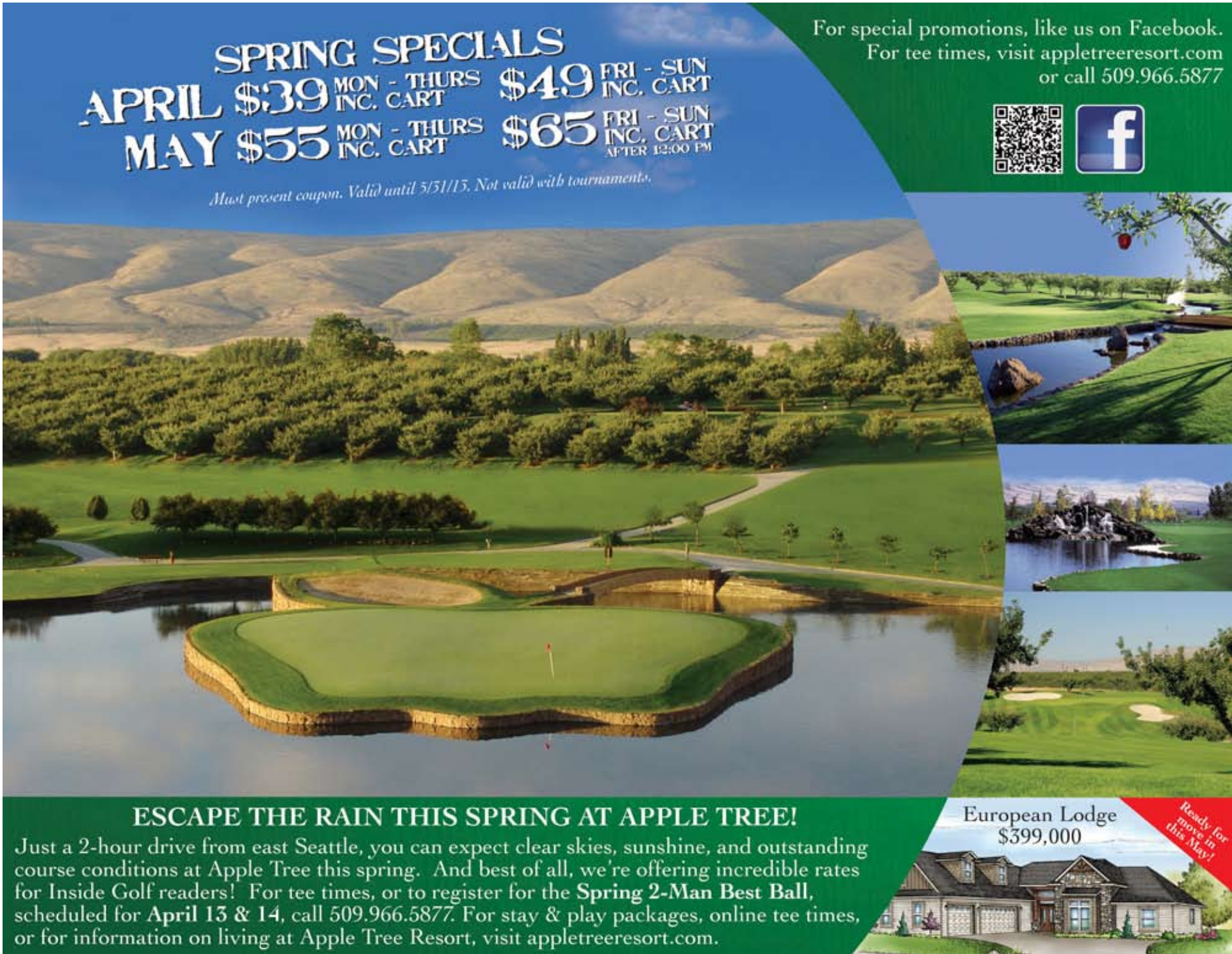
Apple Tree Resort in Yakima has a course which winds through an apple orchard - and features an apple-shaped green.

One of the newest resorts to come on the radar in the state of Washington –