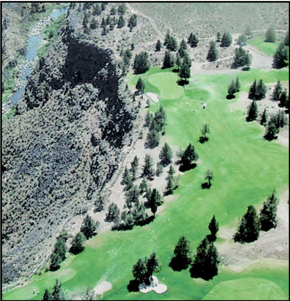
Crooked River Ranch offers a stunning setting for golf and has plenty of amenities.

The course, the only Palmer designed course in Oregon, has hosted some of the biggest Northwest professional and amateur events since opening.