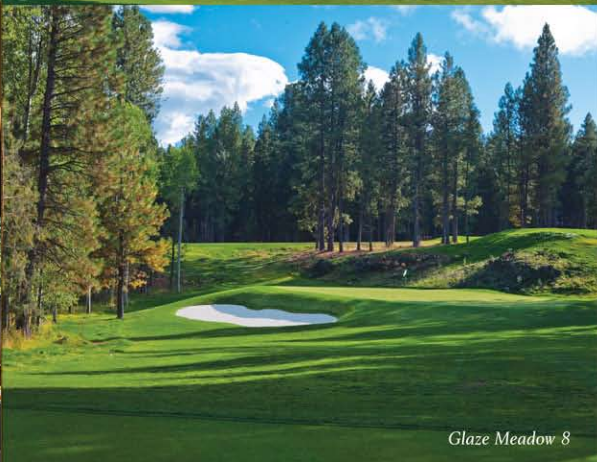
Glaze Meadow 8