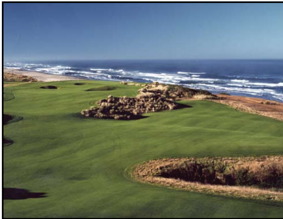
Bandon Dunes offers five courses now, including the original Bandon Dunes.