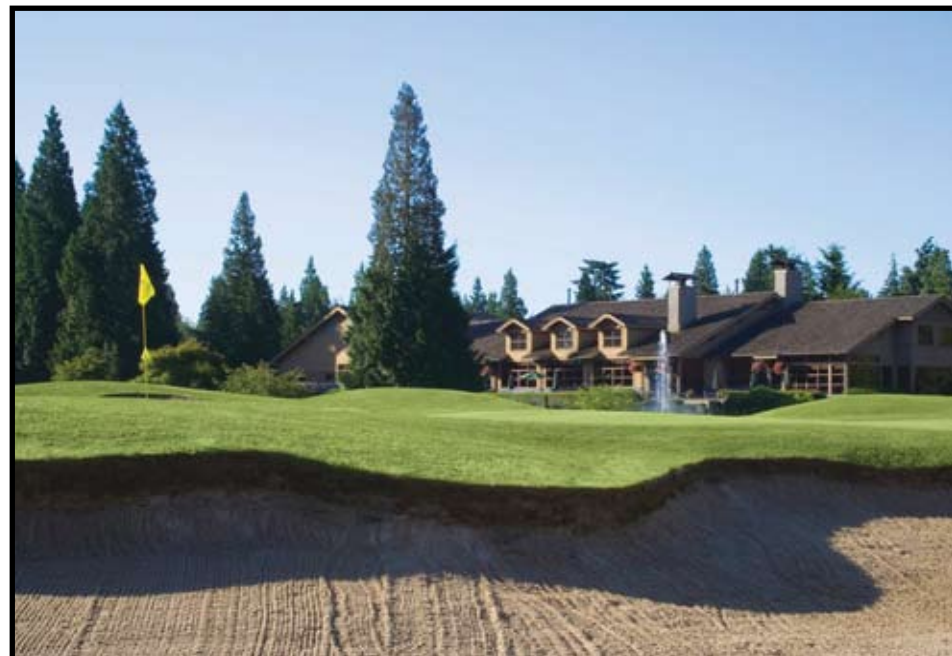
Resort at Port Ludlow (top) and Semiahmoo are a pair of resort courses to try.