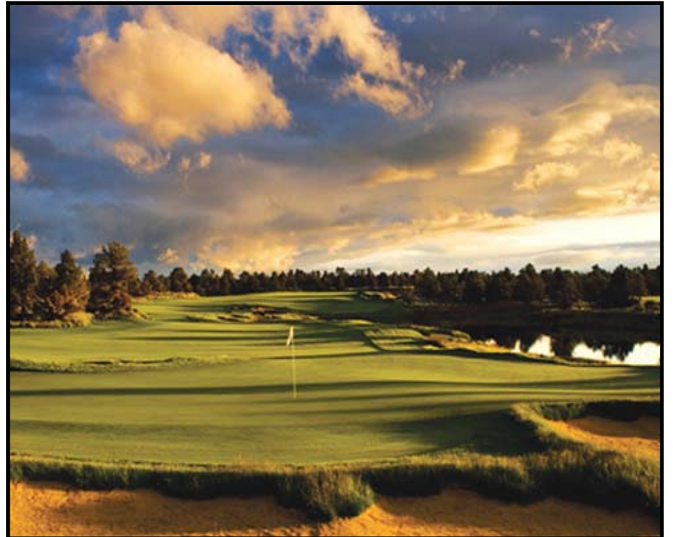
Pronghorn in Central Oregon is ranked 43rd on Golf Digest's list of the top resorts.

Also winning awards from Golf Magazine were Coeur d'Alene and Sunriver that earned Gold Medal awards from the publication. Golf Magazine also had a list of its top "Green" resorts. Winning that award were Bandon Dunes and Sunriver Resort.