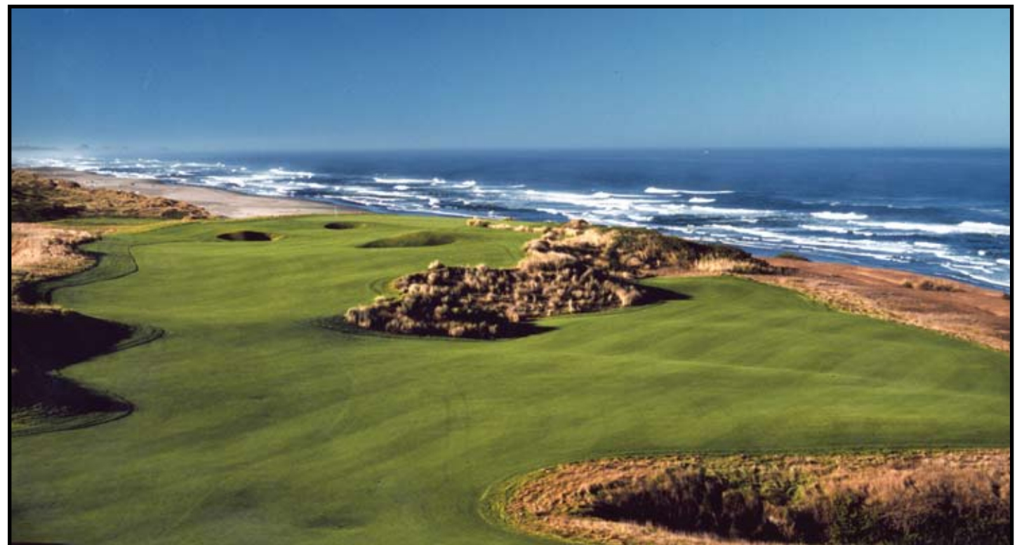
Bandon Dunes Resort on the Oregon Coast is the top-rated golf resort by Golf Digest Magazine and a Platinum Award winner by Golf Magazine .