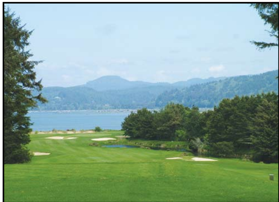
Salishan Golf Links in Gleneden Beach offers great views of the Pacific Ocean.