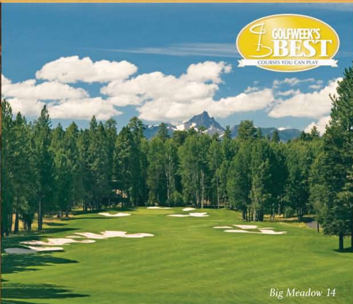
Big Meadow 14