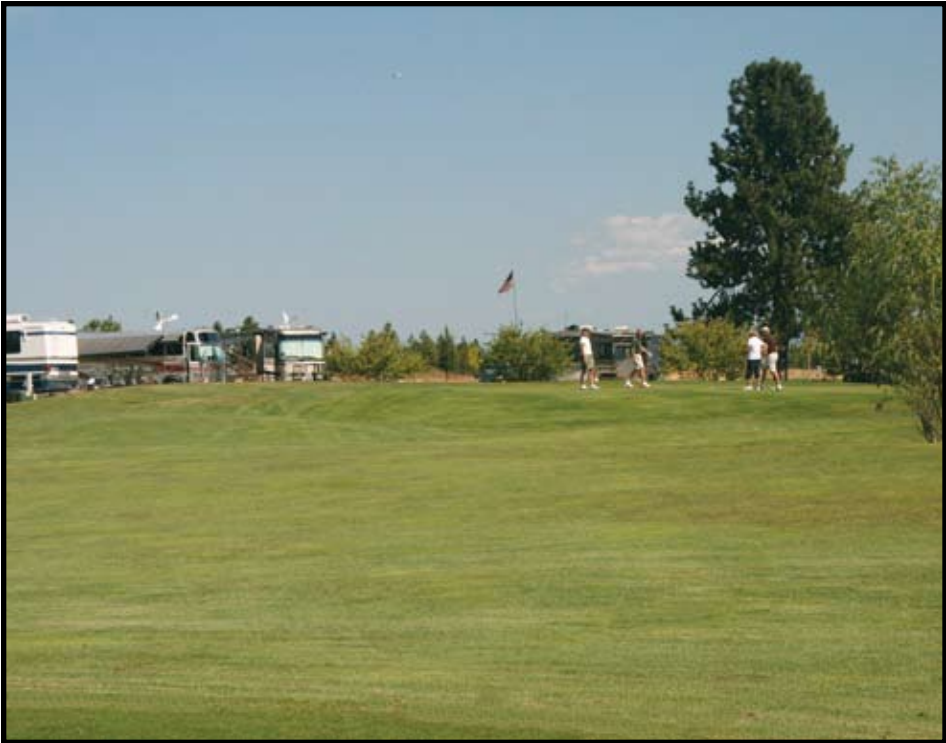
Spokane RV Resort offers a place for RV travelers to stay and play at Deer Park.

And now, with the opening of the Salish Cliffs Golf Course, the resort boasts one of the top courses in the Pacific Northwest. In fact, the course was ranked among the top new courses in the country to open for play last year. The course