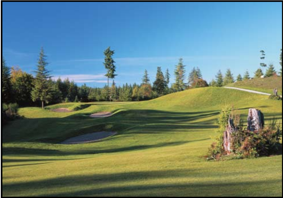
White Horse Golf Club is part of the Clearwater Resort in Kingston, Wash.