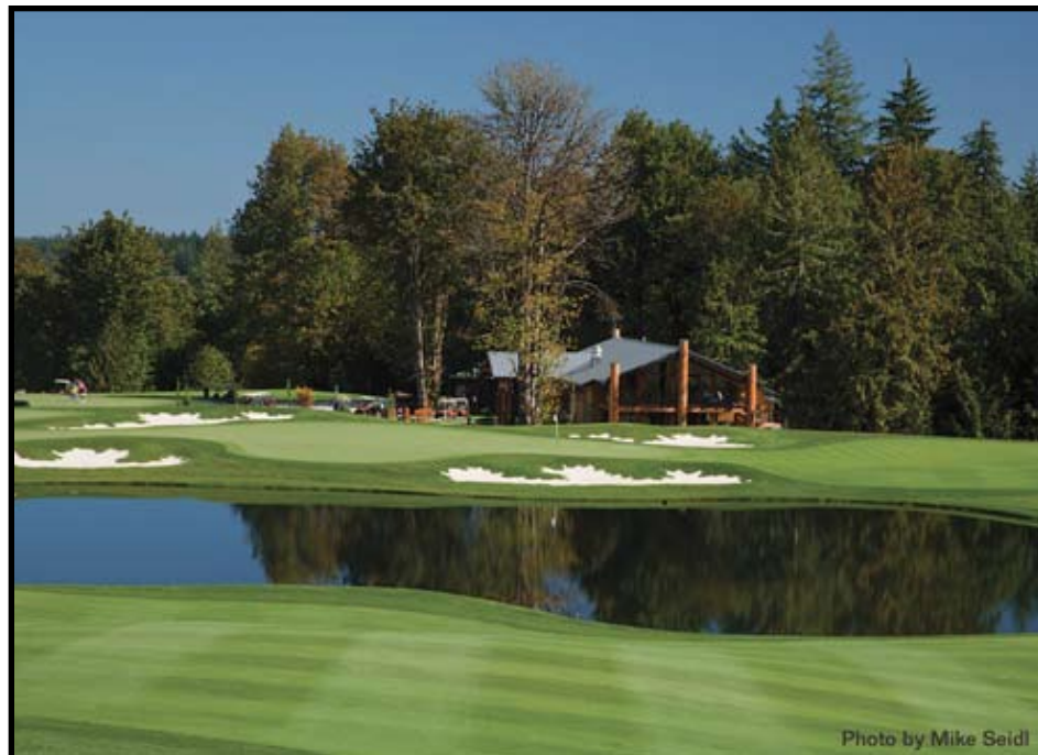
Little Creek Casino is offering a Stay and Play package for its Salish Cliffs course.