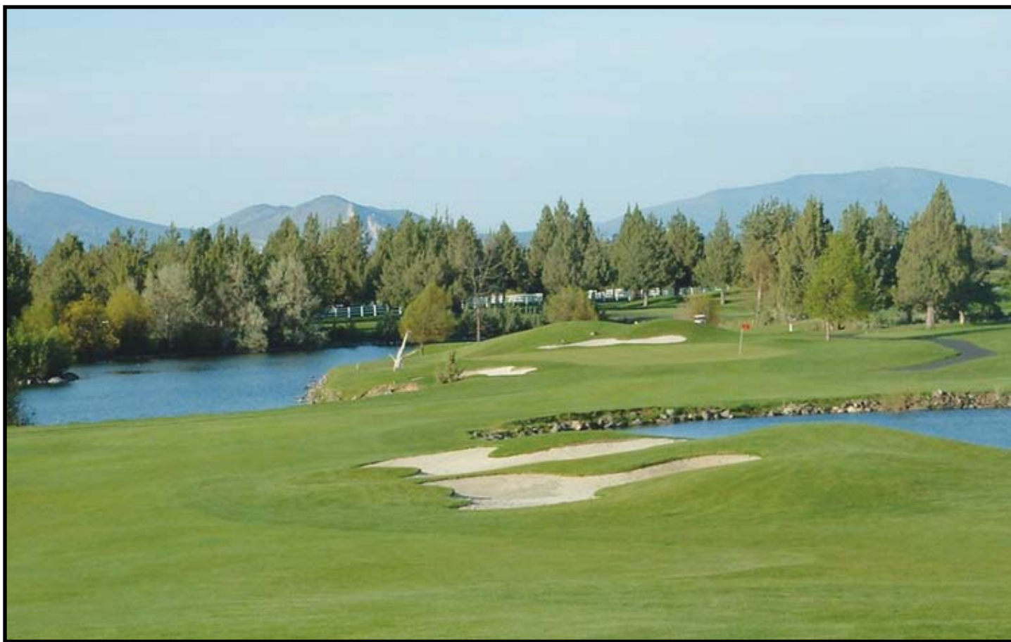
Eagle Crest Resort in Redmond has two courses to choose from including a putting course and a 9-hole Challenge Course.

Oregon saw a new golf resort open in the central part of the state in Brasada